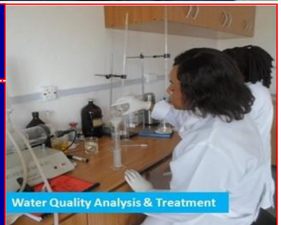
Water Quality Analysis & Treatment