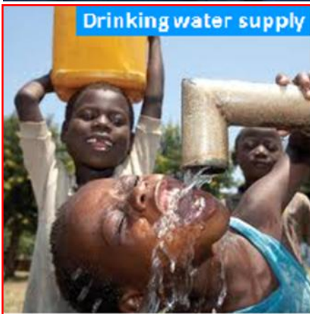
Drinking water supply