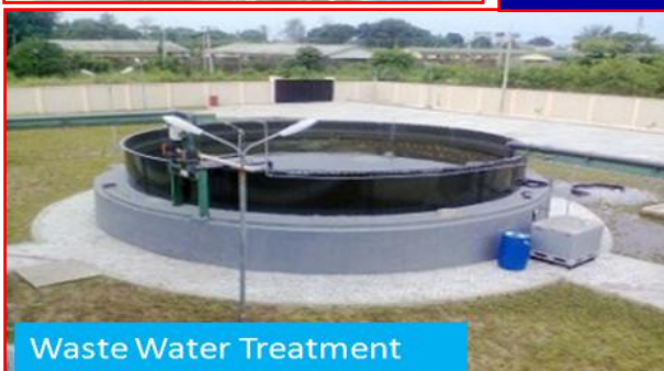
Waste Water Treatment